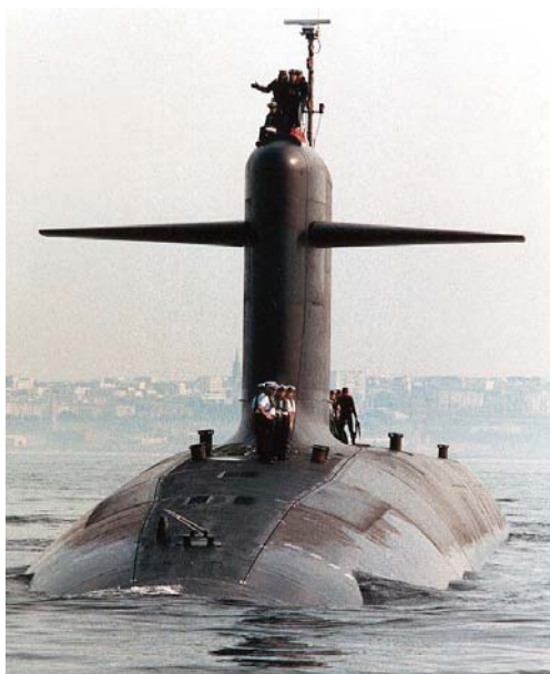
Monitoring the air quality in submarines

■ In France : Air Liquide Areva, Arkema, Artélia, CEA, CLEMESSY, CNRS, Eau & Industries, Esso, DGA, DCNS, Fives Pillard, GDF SUEZ, Véolia, Total, SAVE, Novacarb.