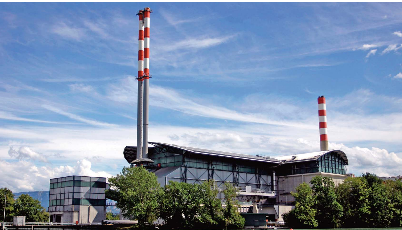
Multi-laser, multi-gas CEM devices for the regulatory measuring of emission discharges

■ Abroad : Creative Oxygen, ELEKTRONIC KONTOR, Exxon, Hobr  Instruments BV, Michell Instruments, MIDREX, Nestl , PRAXAIR, Siemens, Sensors-Inc., SIMTRONICS Fire& Gas, Terrabon.