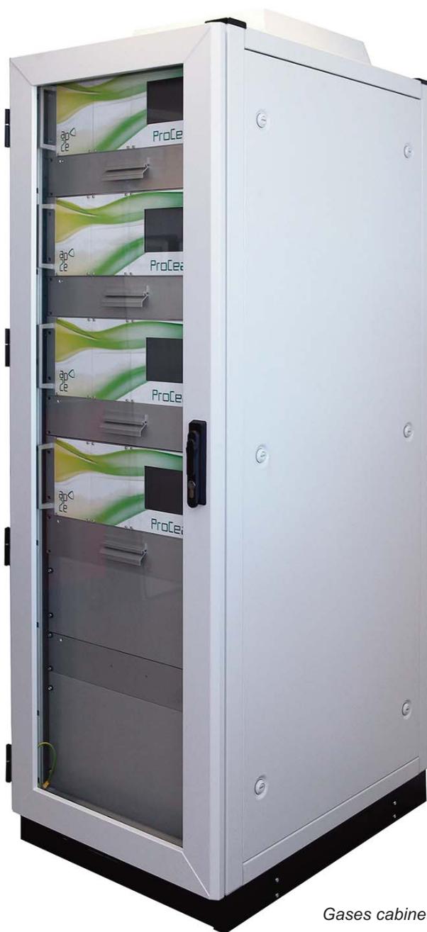
Gases cabinet for ultra-trace analyses

The ProCeas ® is used by producers of pure gases to measure the quality of their gases (N 2 , H 2 , and so forth).