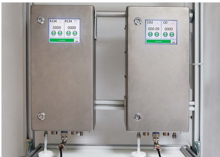
Online monitoring of the couple O 2 and CO

To have continuous and precise knowledge of the SO 2 / SO 3 couple enables the operator to choose the controlling conditions for limiting the formation of SO 3 and its indirect costs.