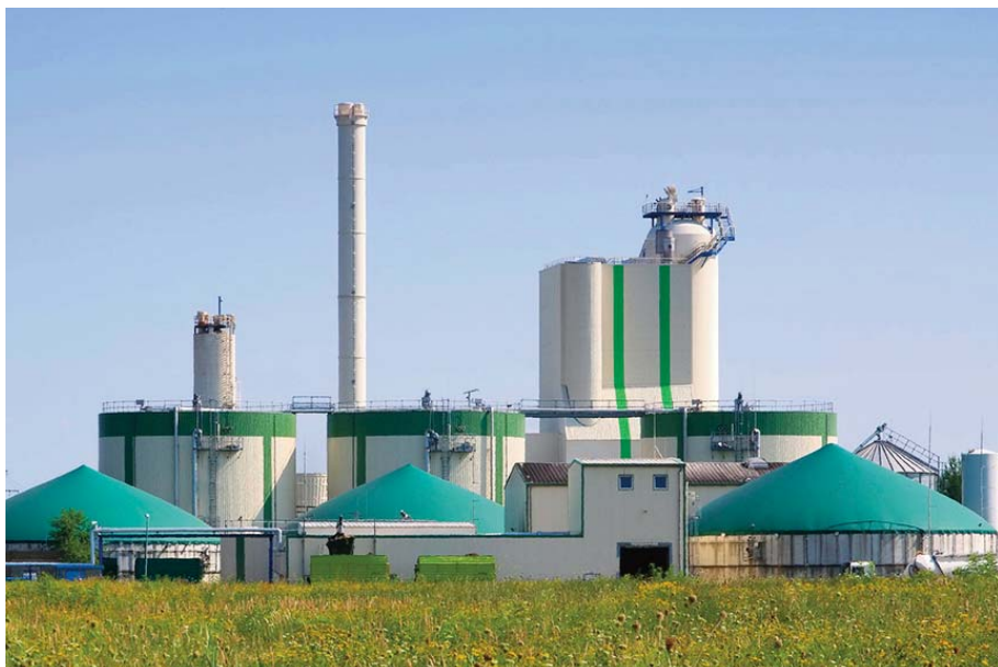
Measuring biogas quality

■ Abroad : Creative Oxygen, ELEKTRONIC KONTOR, Exxon, Hobr  Instruments BV, Michell Instruments, MIDREX, Nestl , PRAXAIR, Siemens, Sensors-Inc., SIMTRONICS Fire& Gas, Terrabon.